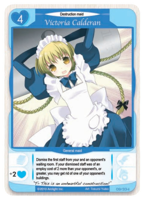
Details : You must decide which player should discard his top card before you apply Victoria's effect.