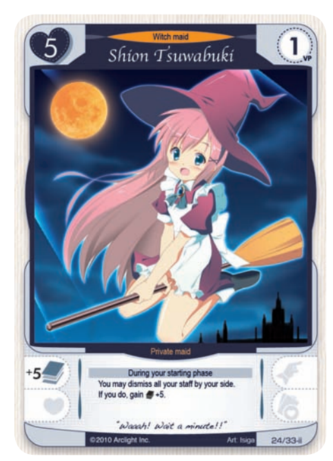
Details: You can't use this ability once you've entered the Serving Phase.