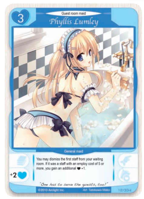
Details : If the discarded card was a cost of 5 or above, the active player gains an extra +2 love, totalling +3 love from Phyllis.