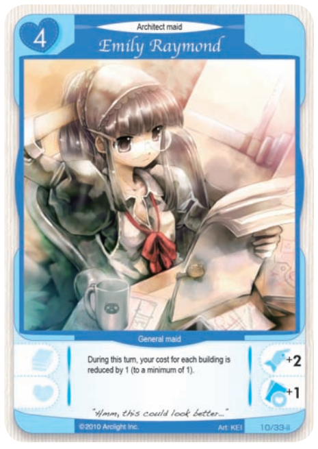
Details : If you play several Emilys, the cost is reduced by 1 for each Emily you play. However, the cost for any building cannot go below 1. Emily's cost lowering effect is applied after Ririko's.