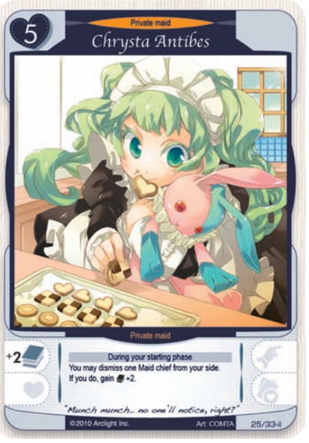
Details : You can't use this ability once you've entered the Serving Phase.