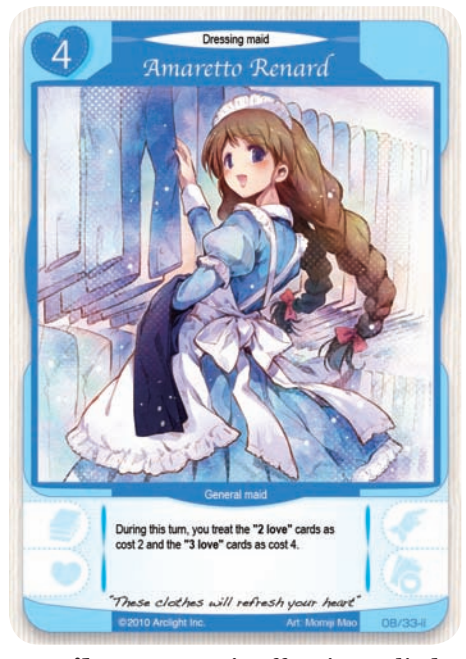
Details : Amaretto's effect is applied to all cards in the game, those in your hand, in town, your draw pile, kitchen entrance etc. If you play Lilac after having played Amaretto, you may choose a "3 love" card.