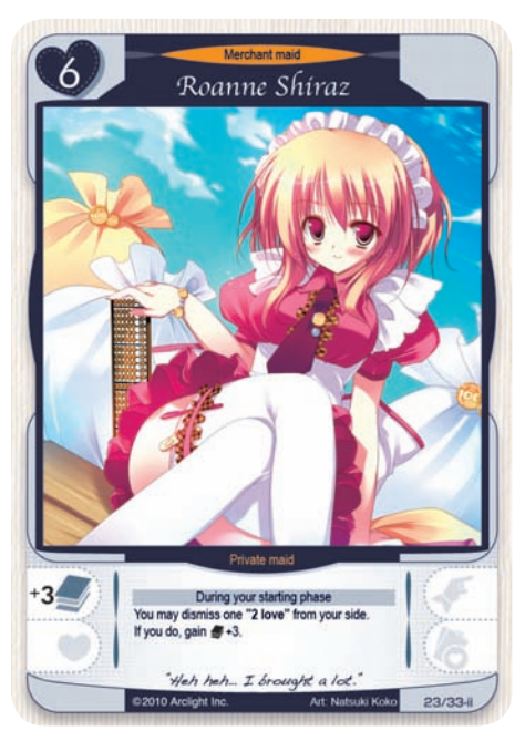
Details : You can't use this ability once you've entered the Serving Phase.