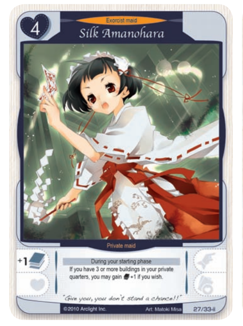
Details: You will only get +1 card, no matter how many buildings you have.