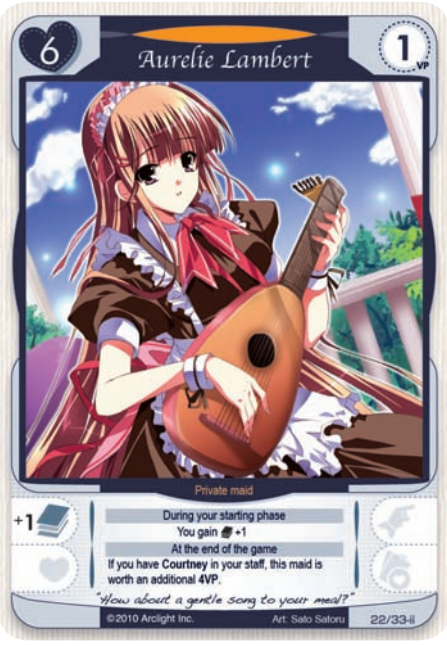
Details : A player who has both Courtney and Aurelie, recieve a total of 10VP (1+4+1+4).