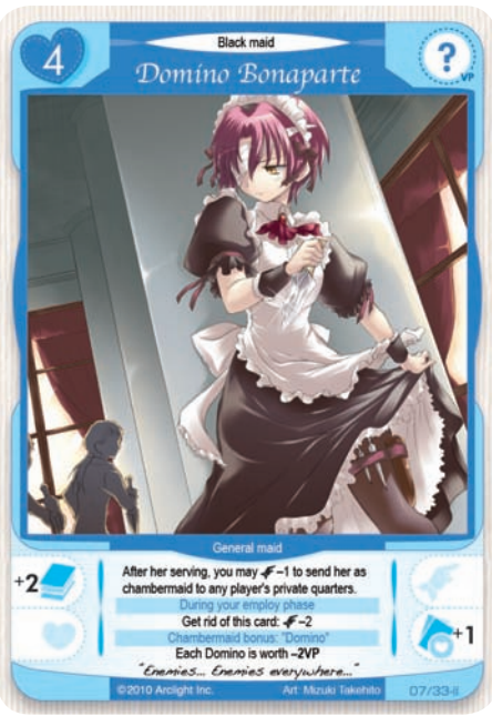
Details : The active player first plays Domino as usual. After having played her, the player may consume 1 additional Serving to chambermaid Domino into another player's Private Quarters. The player who has Domino in his house may spend 2 Servings during his Serving phase to return Domino to the town. At the end of the game, each Domino that a player has as a chambermaid is worth -2VP.