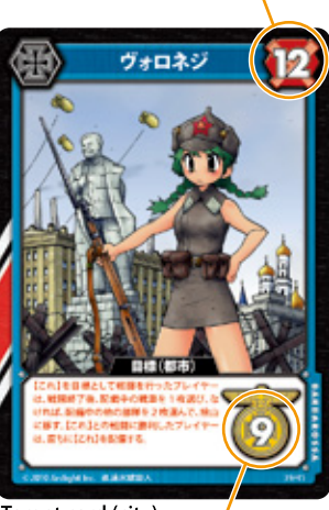
Target card (city)