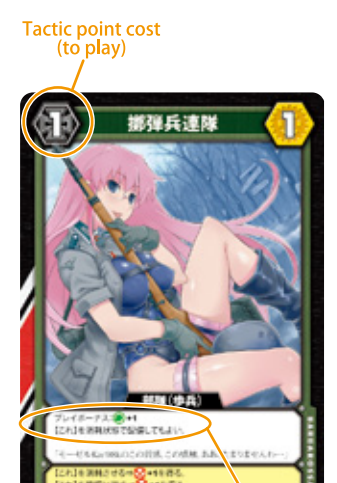
Effects gaind from playing