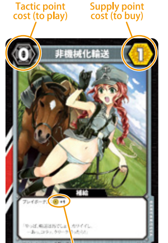
Supply points gained from playing