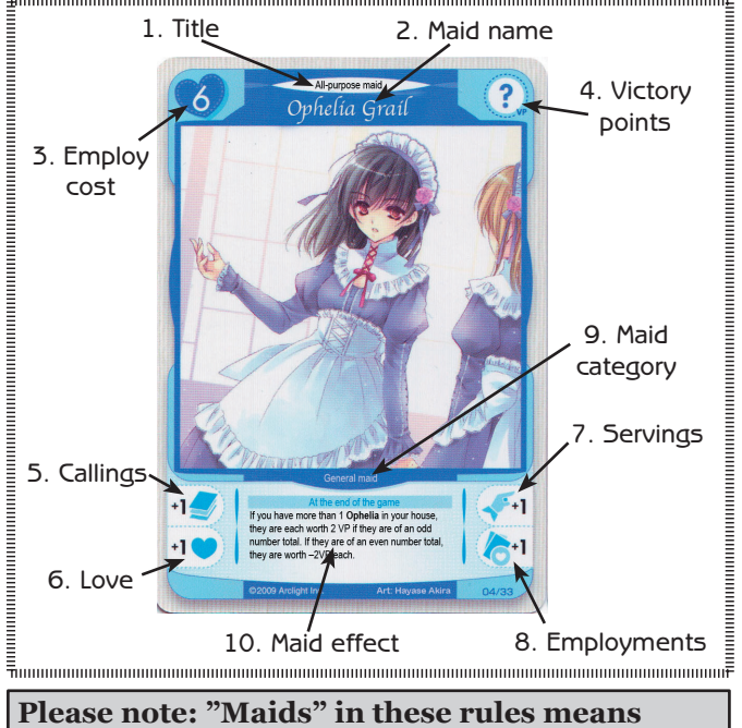
collectively general maids, maid chiefs and private maids. Love cards are not maids, however, they are part of the staff.

Playing a maid card from your hand (being served by a maid) costs one "serving". Each player has one serving per turn, so basically, the player can only be served by one maid per turn. (However, certain maids generate more "servings" and will thus allow the player be able to be served by more maids).